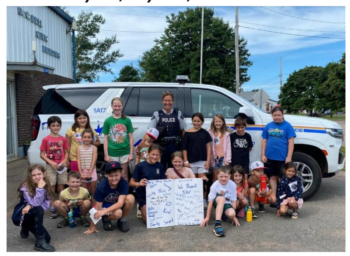
Thank you, CST Hall